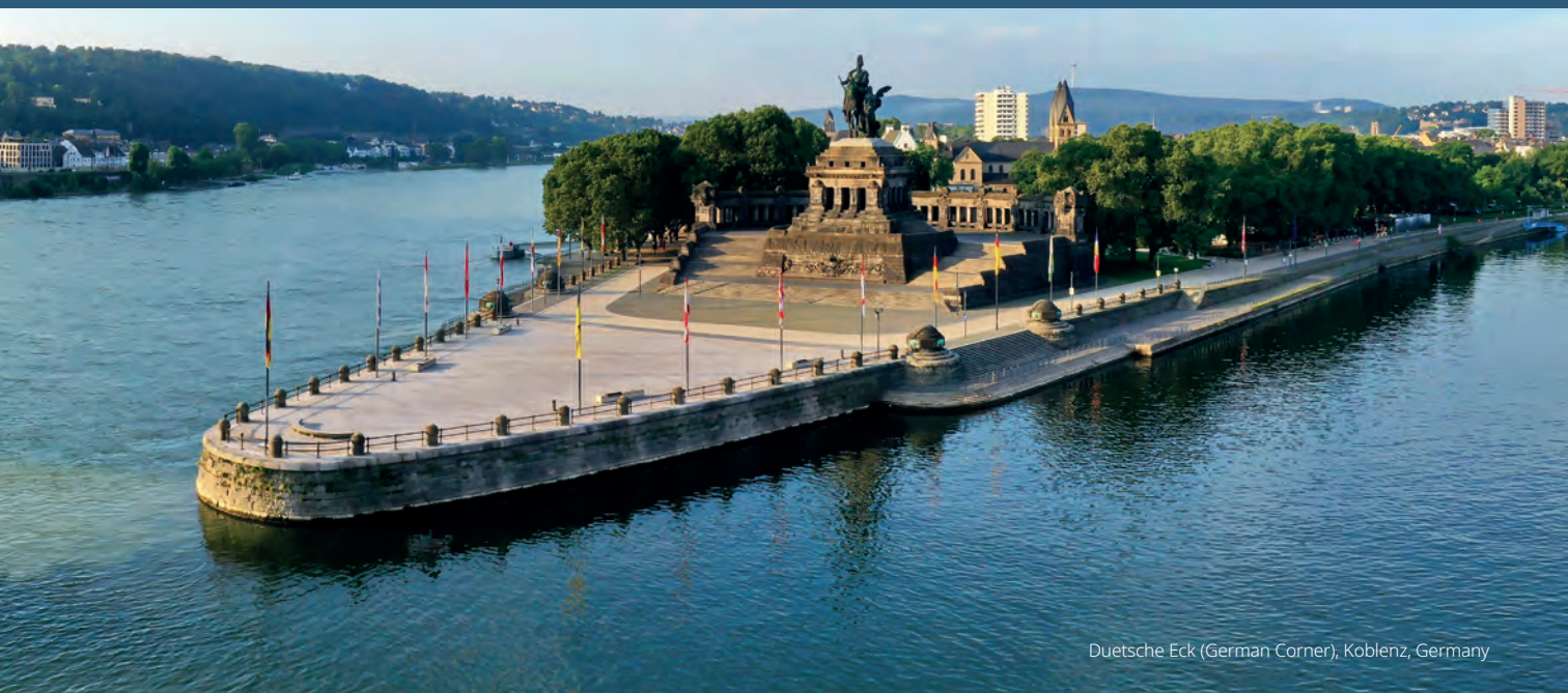
Duetsche Eck (German-Corner), Koblenz, Germany

Voyage through the heart of Europe on a Rhine river cruise, where history, culture and riverside landscapes meet. Explore Amsterdam's canals, stand beneath the towering spires of Cologne Cathedral and stroll through Strasbourg's old town. On board, enjoy lively evenings and soak up the ever-changing scenery as you cruise through the romantic Middle Rhine, surrounded by steep vineyards, medieval castles and half-timbered towns.