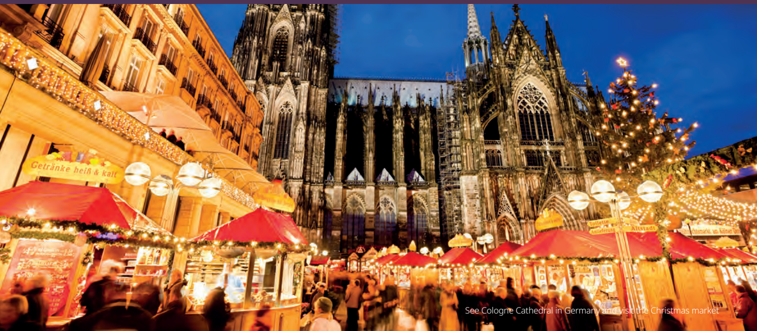
See Cologne Cathedral in Germany and visit the Christmas market

Sail through the heart of Europe on a festive journey along the Rhine. Explore storybook towns, twinkling Christmas markets and local traditions from Düsseldorf to Basel. With guided walks, seasonal tastes and optional experiences along the way, this river cruise blends cultural highlights with the magic of the holidays.