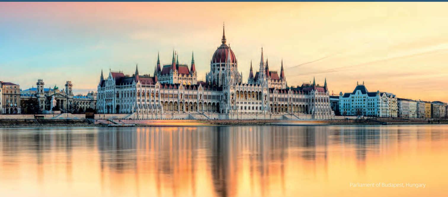
Parliament of Budapest, Hungary

Cruise the Danube and uncover a mix of history, culture and local traditions. Visit Budapest's Heroes' Square, stroll through Bratislava's medieval Old Town and enjoy a taste of Vienna's famous Sachertorte. Enjoy lively evenings on board, sharing stories over regional wines and soak up the ever-changing scenery. This Danube river cruise offers you the perfect mix of discovery, fun and relaxation on one of Europe's most iconic rivers.