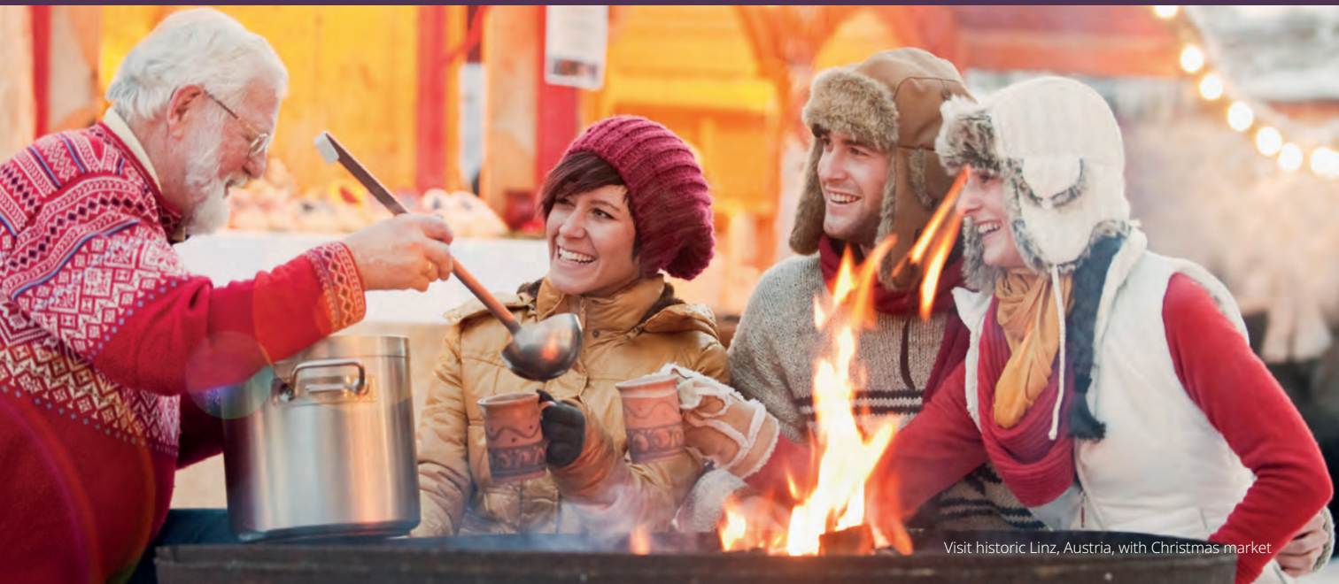
Visit historic Linz, Austria, with Christmas market

Cruise the Danube and uncover a mix of history, culture and local traditions wrapped in the spirit of the season. Visit Budapest's Fisherman's Bastion, stroll through Bratislava's medieval Old Town, browse Europe's favourite Christmas markets, and see Vienna's historic landmarks.